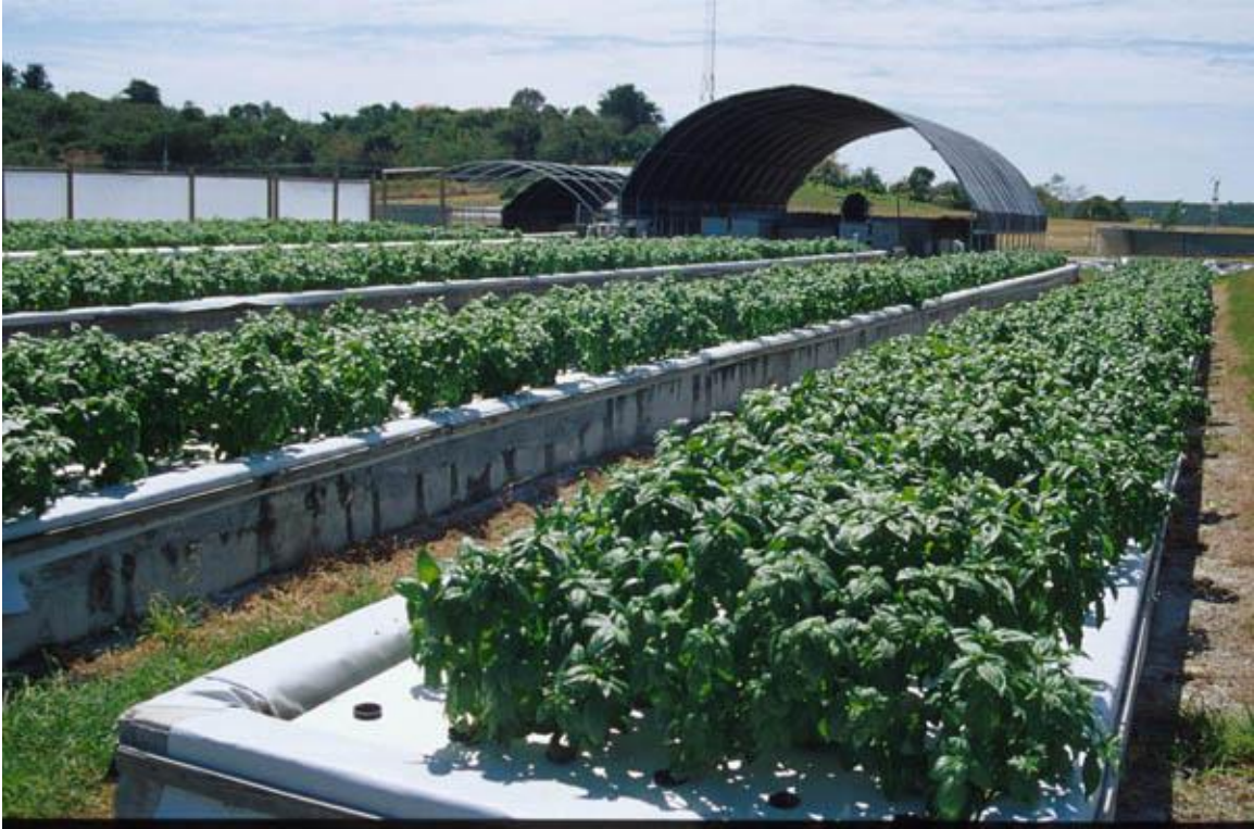
Figure 2. Basil production in the UVI aquaponic system (CA2).